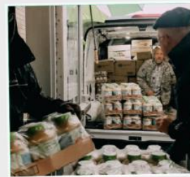
Job Shell Program