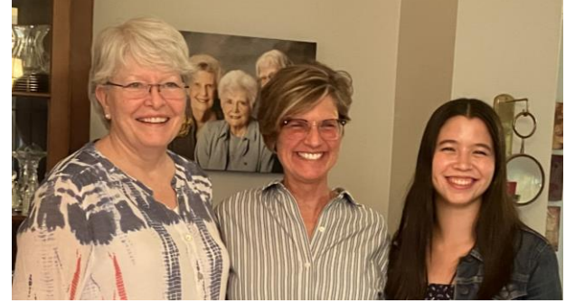
Impact Scholarship recipient.

National Women's Leadership Conference - October 4 - 7 Chattanooga, Tennessee, at the Marriott Hotel on October 4 through 7. Novi Oaks members will be reimbursed after