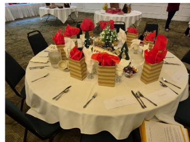
Fresh Cut Christmas Trees by Chris Struwe