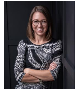
Caitlin Falenski Oppenheimer & Co. Zoom Only / Free