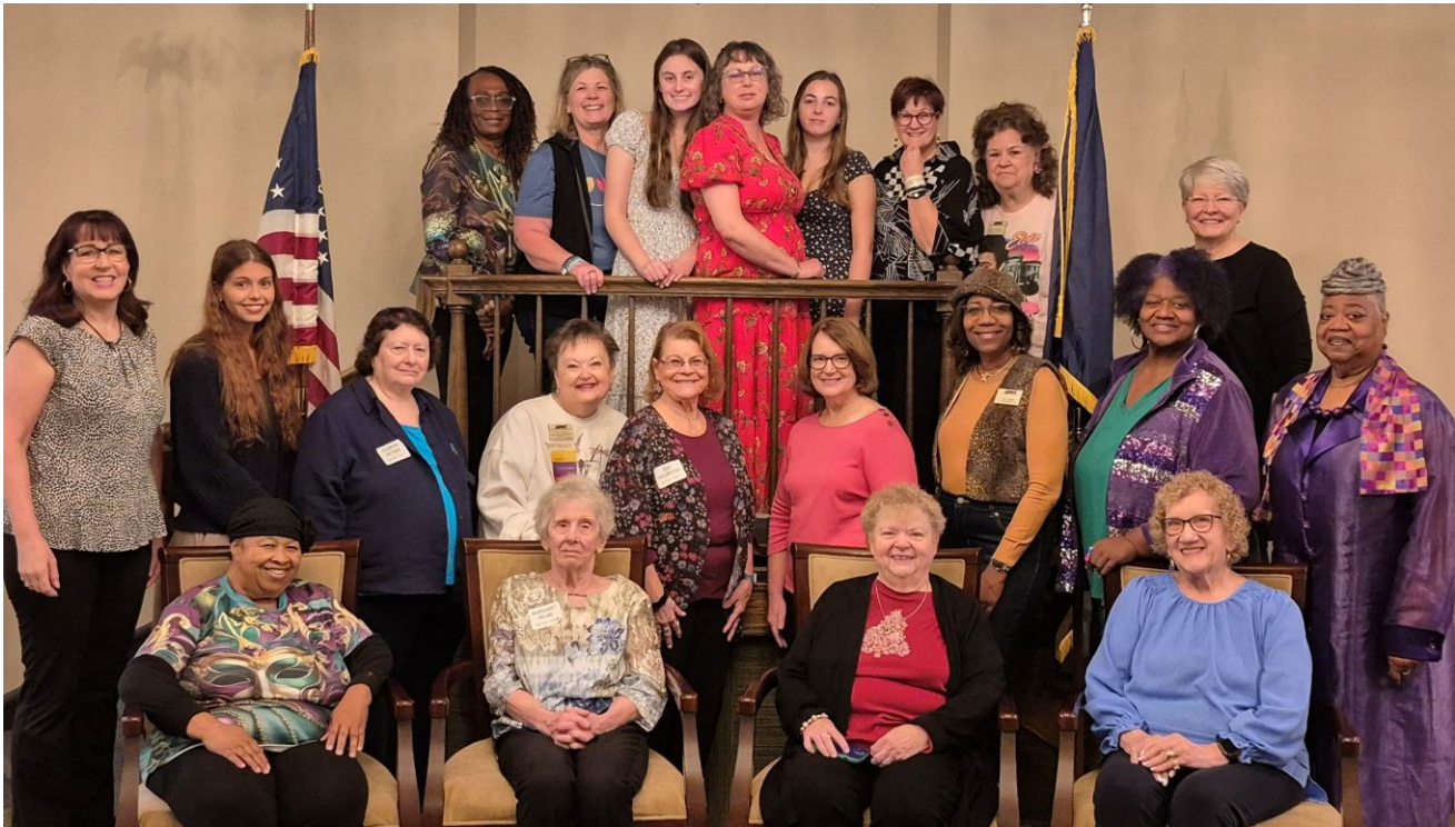
Novi Oaks members (*), family, and friends who hosted guest tables and helped with the auction:

We are already planning our 2026 auction, which will be held at the Hellenic Cultural Center in Westland on Saturday, October 24, 2026. Business sponsors of this event are always appreciated.