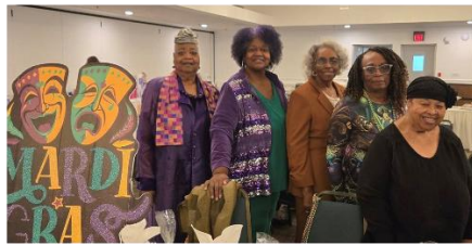
Members of Nu-Lite Chapter, Flint.